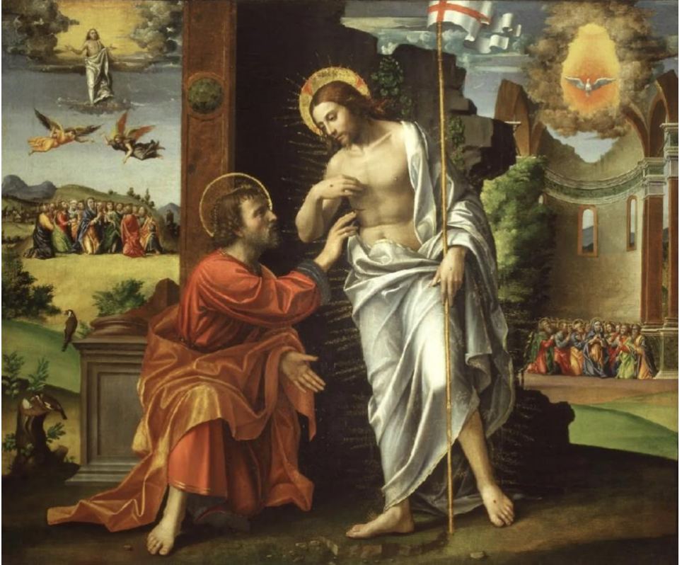
Paolo Moranda Cavazzola The Incredulity of St Thomas 1520 Museo di Castelvecchio, Verona