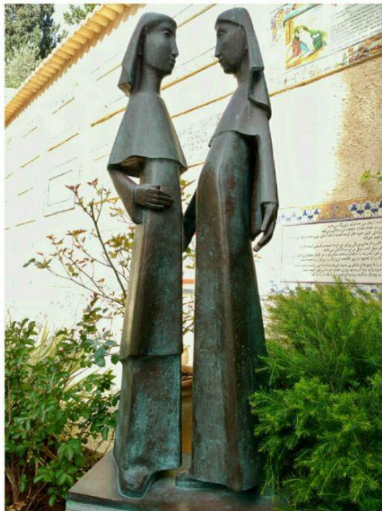
Mary & Elizabeth, Church of the Visitation, Ein Karem, Jerusalem

Fourth Sunday of Advent 23 December 2018