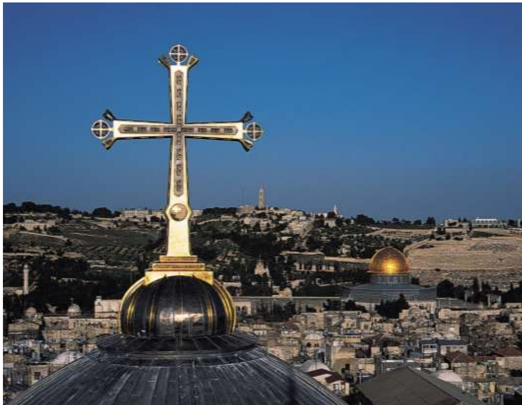
Cross on top of the Holy Sepulchre, Jerusalem. Looking east to the Dome of the Rock & the Mount of Olives