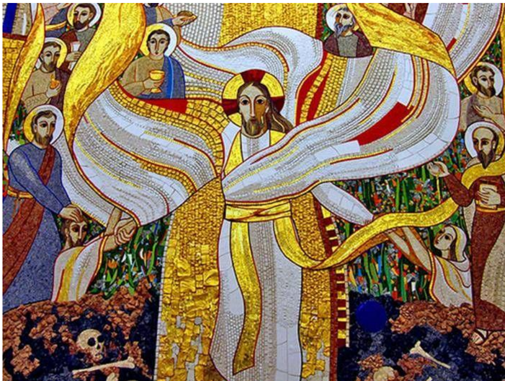
Rupnik: Resurrection of Christ (detail) 2006. St Stanislaus College Chapel, Ljubljana, Slovenia