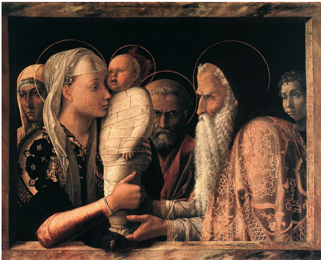
Andrea Mantegna Presentation at the Temple c.1455 Gemäldegalerie, Berlin

Feast of the Holy Family 31st December 2023