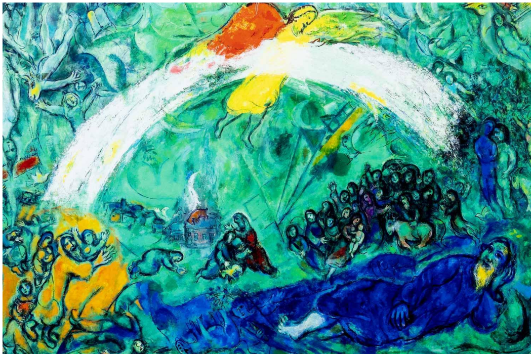
Marc Chagall Noah and the Rainbow 1966 Musée Marc Chagall, Nice