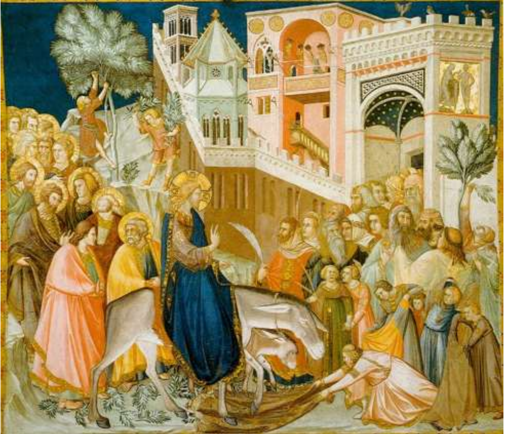
Pietro Lorenzetti Entry of Christ into Jerusalem 1320 Basilica of St Francis, Assisi