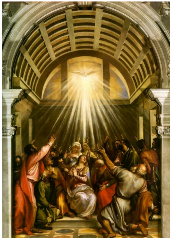
Titian: The Descent of the Holy Spirit, 1545. Santa Maria della Salute, Venice