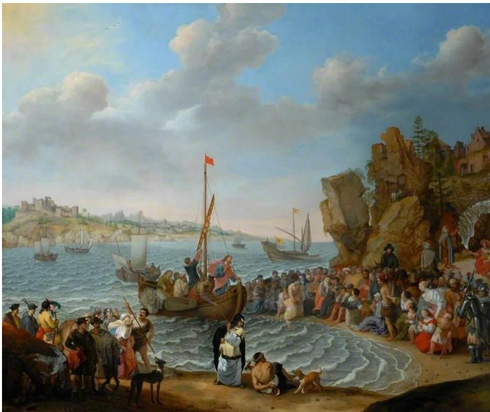
Adam Willaerts (1577-1664) Christ Preaching from a Ship on the Sea of Galilee Bowes Museum, Co. Durham

Sixteenth Sunday of the Year 18 July 2021 Year of St Joseph