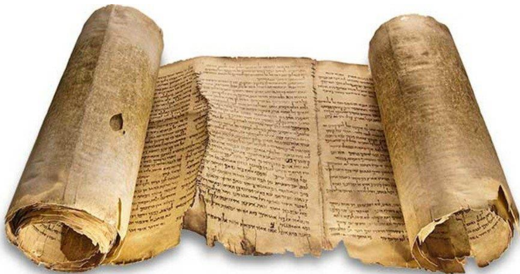
The Great Isaiah Scroll 120BC, one of the Dead Sea Scrolls discovered in 1947 at Qumran, Israel.

Third Sunday of the Year 27 January 2019