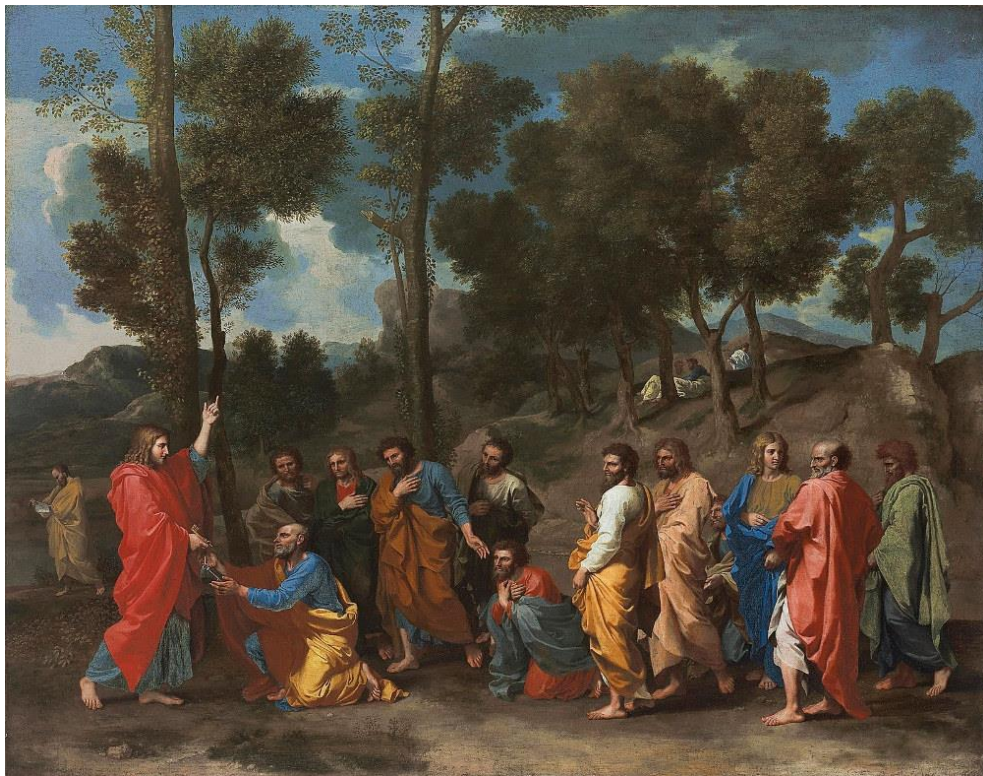
Nicolas Poussin: Sacrament of Ordination, 1636-1639. Kimbell Art Museum, Texas USA.

Fourteenth Sunday of the Year 7 July 2019