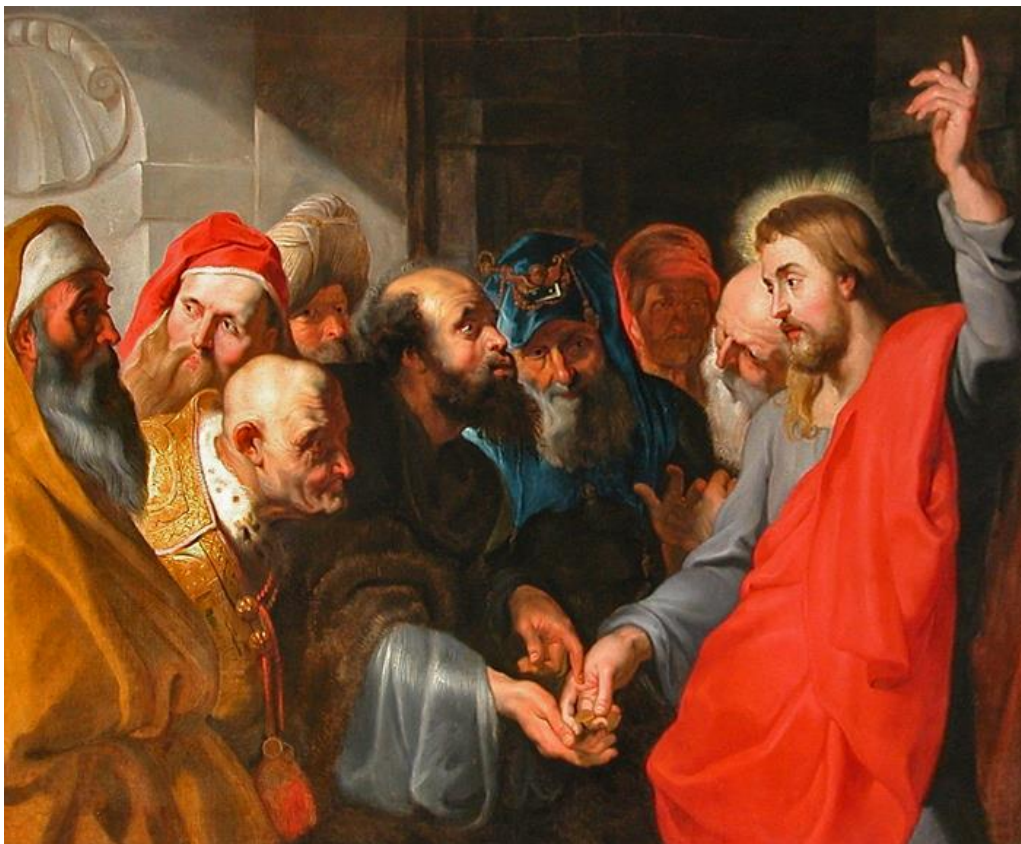
Peter Paul Rubens The Tribute Money 1612-1614 Museum of Fine Arts, San Francisco

Twenty ninth Sunday in Ordinary Time 18 October 2020